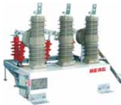
Combined apparatus with disconnect switch