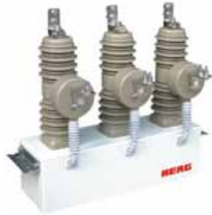
Permanent Magnet(epoxy resin)

ZW43-12 model outdoor AC vacuum circuit breaker is used to make and break load current, overload current and short-circuit current in 12kV, 50/60Hz power system. It is applicable for substations, industry and mining, urban and rural electricity power networks, especially applicable in occasions with frequent operation and automatic power distribution network. It accords with the standard of IEC62271-100 & GB1984: AC high voltage circuit breaker, IEC60694 & GB/T11022: HV general technical requirement of switch and control apparatus.